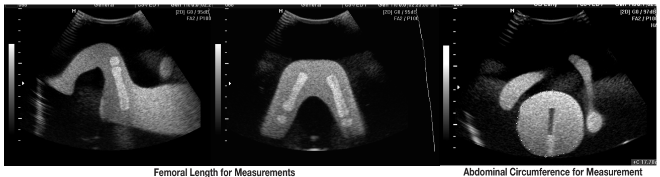
Femoral Length for Measurements