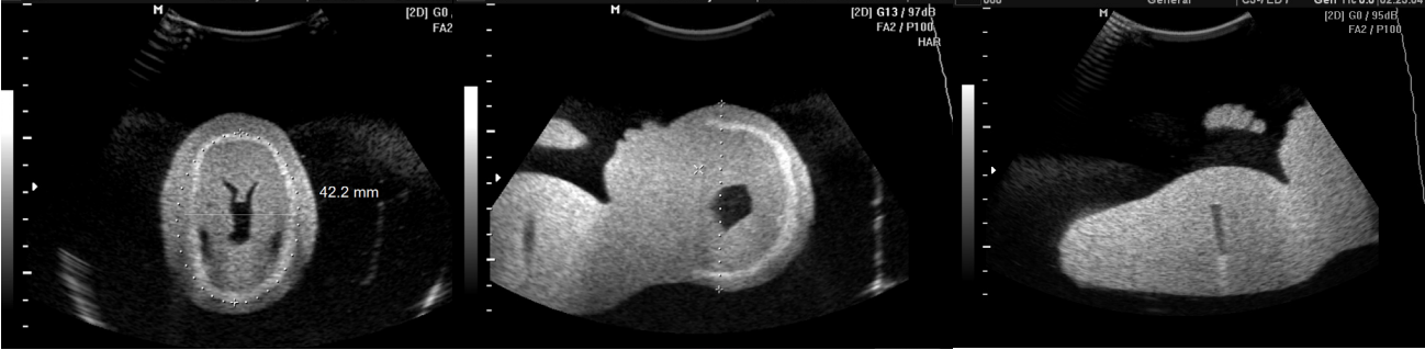
Axial Brain & BPD Measurement